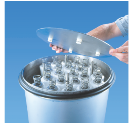
Adjustable top plate accepts variable length cartridges