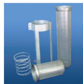
Stainless steel basket, spring and leg assembly