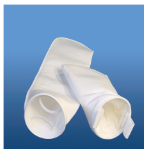
Complete line of bag filter media