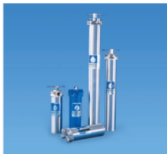
#3 and #4 size Housings

Shelco® manufactures a full line of filter housings. From our rugged single element housings to our heavy-duty multi-rounds and bag housings, we have the right filter for your requirement. Shelco® is the perfect choice for your problem solutions.