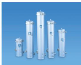
Multi Cartridge Housings