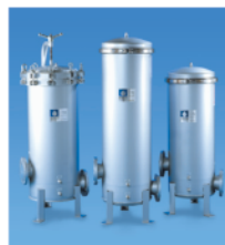
High Flow Multi Cartridge Housings