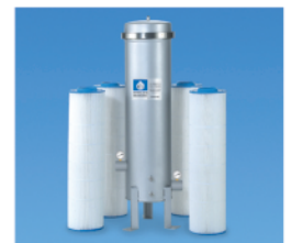
Jumbo Cartridge Housings