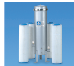
Jumbo Cartridge Housings